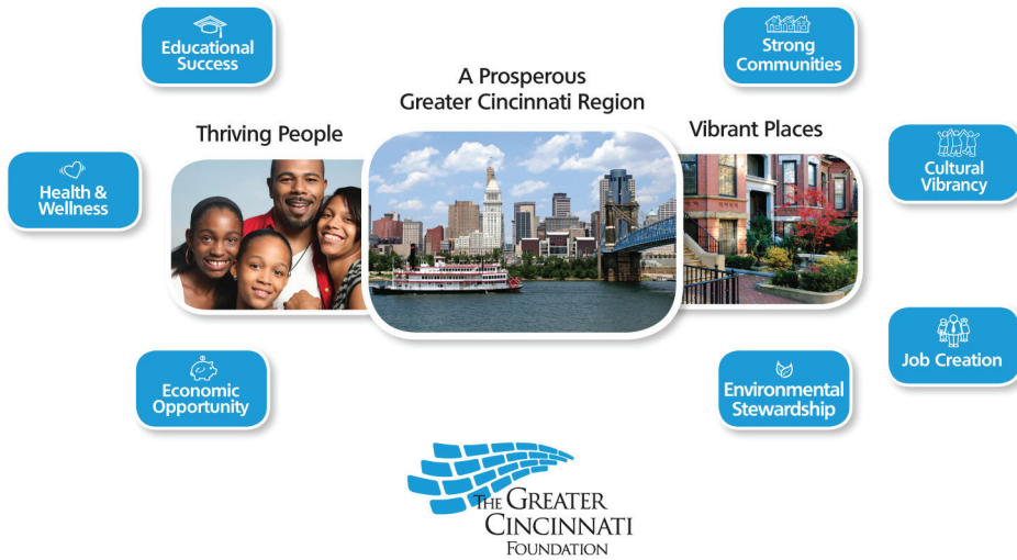
FIGURE 2 Strategic Grantmaking Framework

principal of unrestricted funds because assets used for impact investing are returning 1 percent to 2 percent, much less than the 8 percent market return historically assumed for a spending-policy calculation.